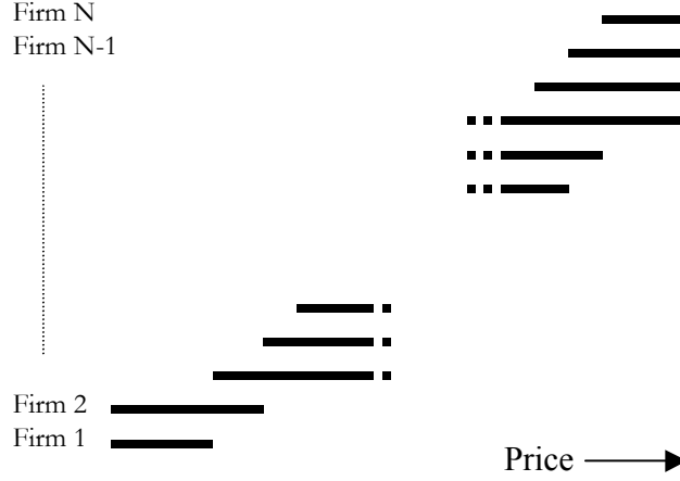
Figure 2: Price Supports

Now consider the “head-to-head” competition that occurs at some given price p . If p is offered in equilibrium, it is offered by a consecutive set of firms l, \dots, m . Each of these firms must be just indifferent to changing its offer slightly away from p . So for each n = l, \dots, m ,